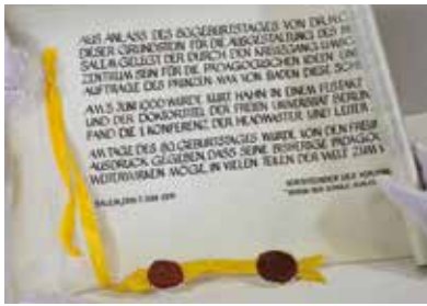
Official Document upon Kurt Hahn's 80th Birthday, 1966

Our archived materials can be used by any interested individual upon application. Please request access by telephone or email.