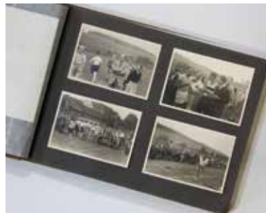
A Student's Photo Album, 1920s

The collection currently holds over 200 meters of archived materials. It includes political and educational writings by and about Kurt Hahn, as well as letters, memorabilia, speeches, paintings and sculptures, an abundance of photographs and photo albums made by students, as well as audiovisual media (videos, DVDs, and films). In addition, it holds a considerable amount of documentation about Schule Schloss Salem, including the estates of Salem teachers and information about other organizations which have followed Kurt Hahn's educational ideas. Furthermore, the archive maintains a library of pedagogical texts, research works and writings by former students.