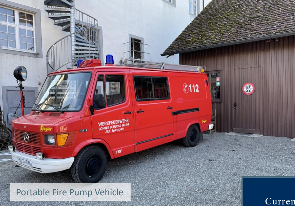
Portable Fire Pump Vehicle