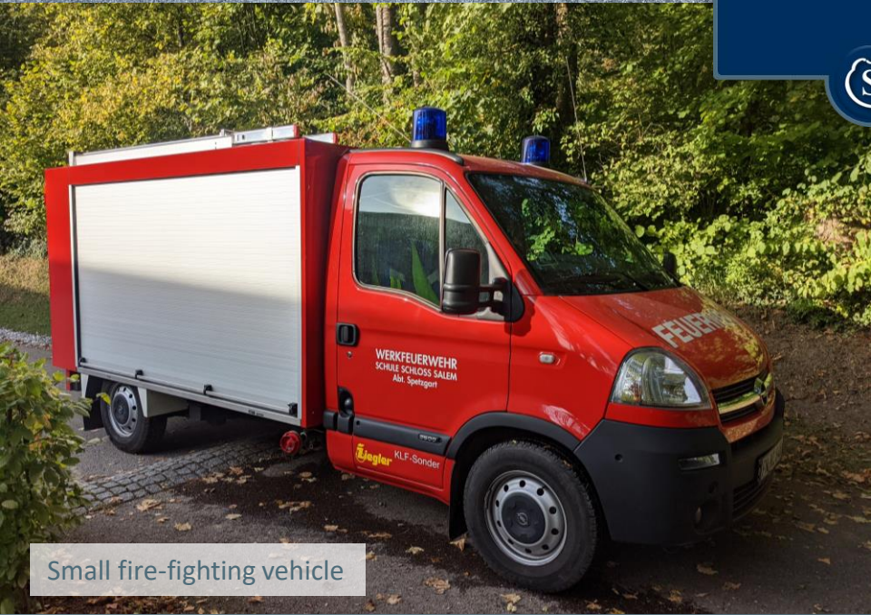
Small fire-fighting vehicle